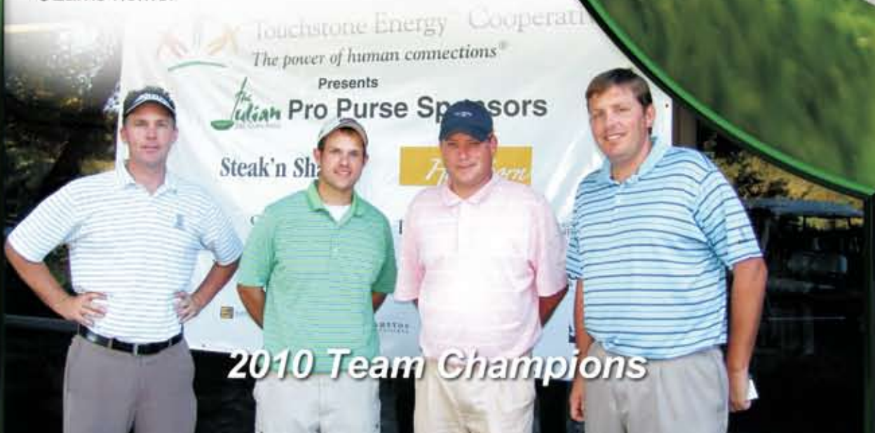
2010 Team Champions